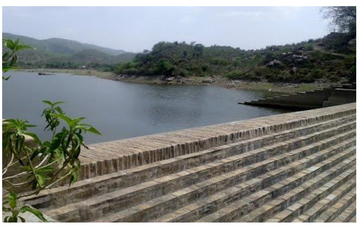
Figure 1- Kot Dam in Shakambari Conservation Reserve

The research work was carried out from the Kot Dam of Shakambari Conservation Reserve, Jhunjhunu District. Shakambari Conservation Reserve is surrounded by Aravalli Hills and spans over 13,100 hectares of forest land. The total geographical area is 144 square kilometres.